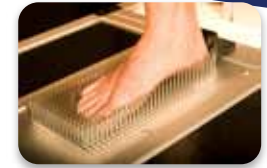
TRUE 3D FOOT SCAN

myFootDr™ uses soft, full-length, CAD/CAM orthotics made from durable, cushioned rubber. Instantly comfortable and ready in one hour*.