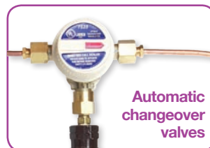
Automatic changeover valves

These automatically switch from one gas bottle to another, when one is empty. To do this, both gas bottle valves are left in the OPEN position. The indicator typically turns red when the first bottle is empty.