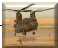
Noventus provides ILS advisory services for Army Aviation

Key Partners - Radixon - Noventus represents Radixon exclusively in Australia. Radixon provides software defined receivers, lawful intercept, monitoring, & surveillance products