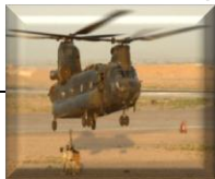
Noventus provides ILS advisory services for Army Aviation

Key Partners - Radixon - Noventus represents Radixon exclusively in Australia. Radixon provides software defined receivers, lawful intercept, monitoring, & surveillance products