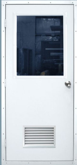
Vision Panel Doors