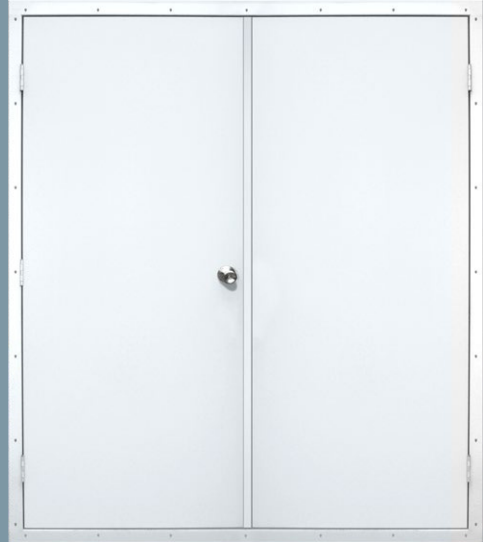
Double Door Systems