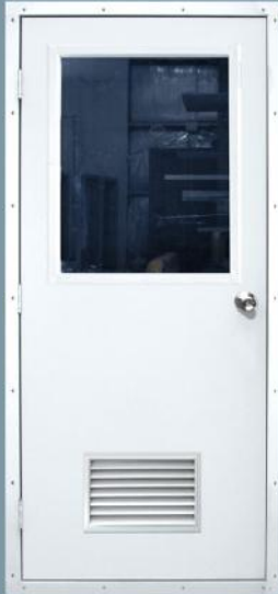
Vision Panel Doors