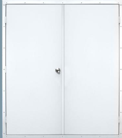
Double Door Systems