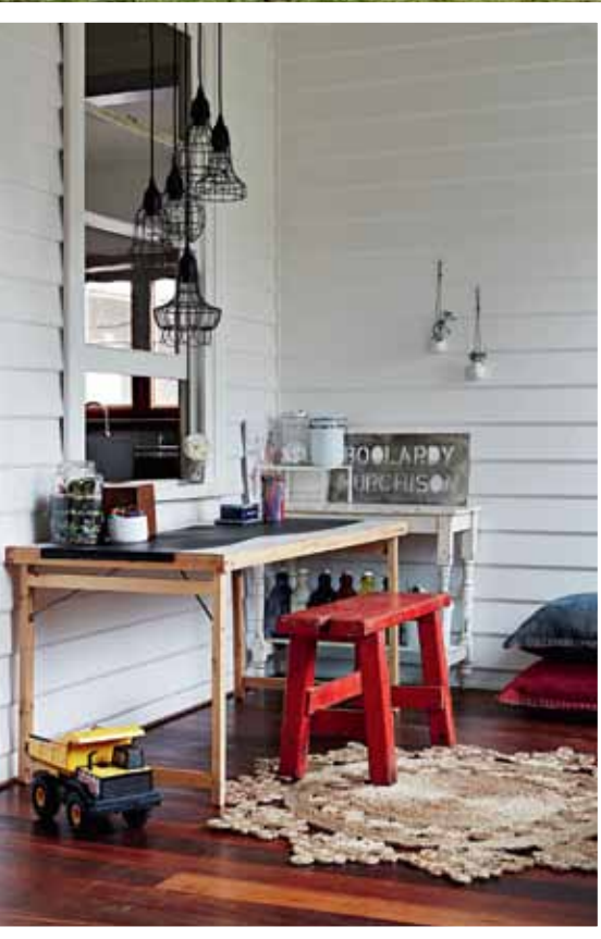
The oldest section of the house dates from 1909; heirloom pieces and original slate tiles in an entry area; the shearing shed dates from 1911; Tracy with a bale weighing machine, a relic of the property's long history as a sheep station; Henry's 'craft zone'. FACING PAGE The stone section of the house was built by Italian prisoners of war in the early 1940s.