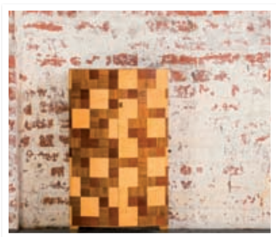
A corner of Cranmore Home's Moora showroom