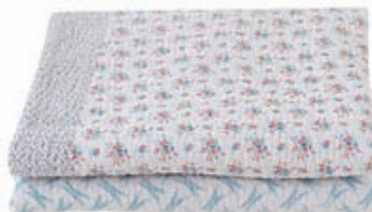
The stunning Katha2 quilt from Lazy Bones

VISIT US... Cranmore Home is open Tuesday, Wednesday and Friday from 8am to 4pm, or www.cranmorehome.com.au is open 24/7.