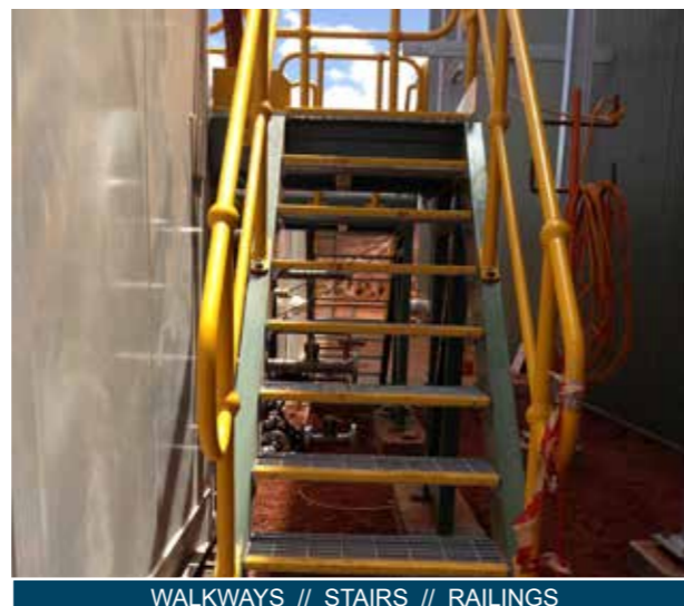
WALKWAYS // STAIRS // RAILINGS