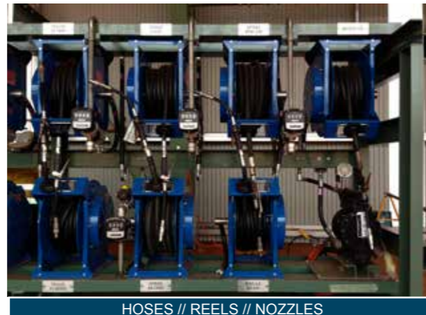
HOSES // REELS // NOZZLES