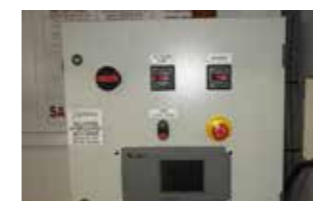
AUTOMATIC TANK GAUGING