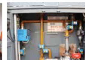
PUMP BAY // METERS