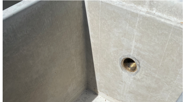
Float Valve Chamber with 1½" or 2" Inlet