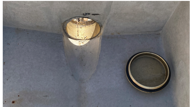
Recessed Drain & Bung