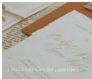
Deckled Edge Card (See paper types)