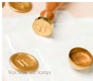
Wax Seals and Stamps