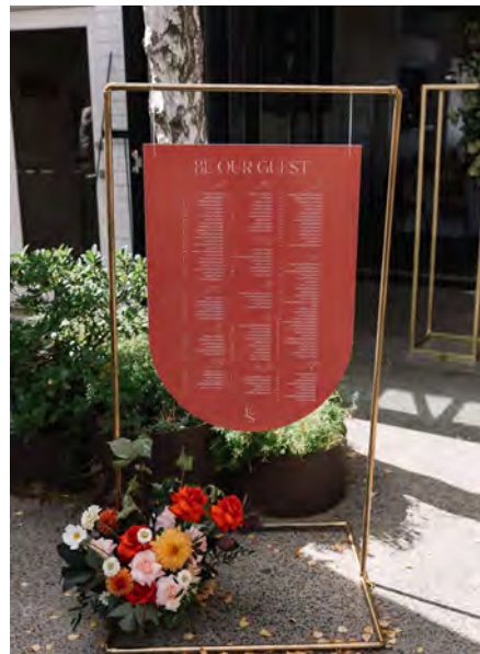
Styling and Coordination: The Modern Romantic