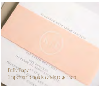
Belly Band (Paper strip holds cards together)