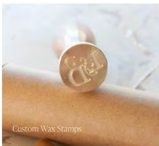
Custom Wax Stamps