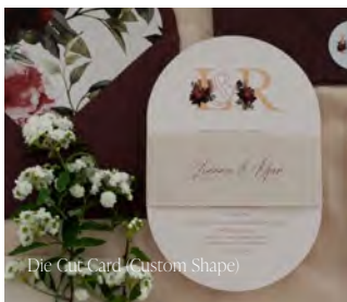
Die Cut Card (Custom Shape)