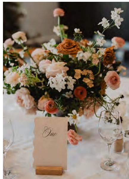
Flowers: As Sweet as Jasmine | Venue: Rydges Hunter Valley