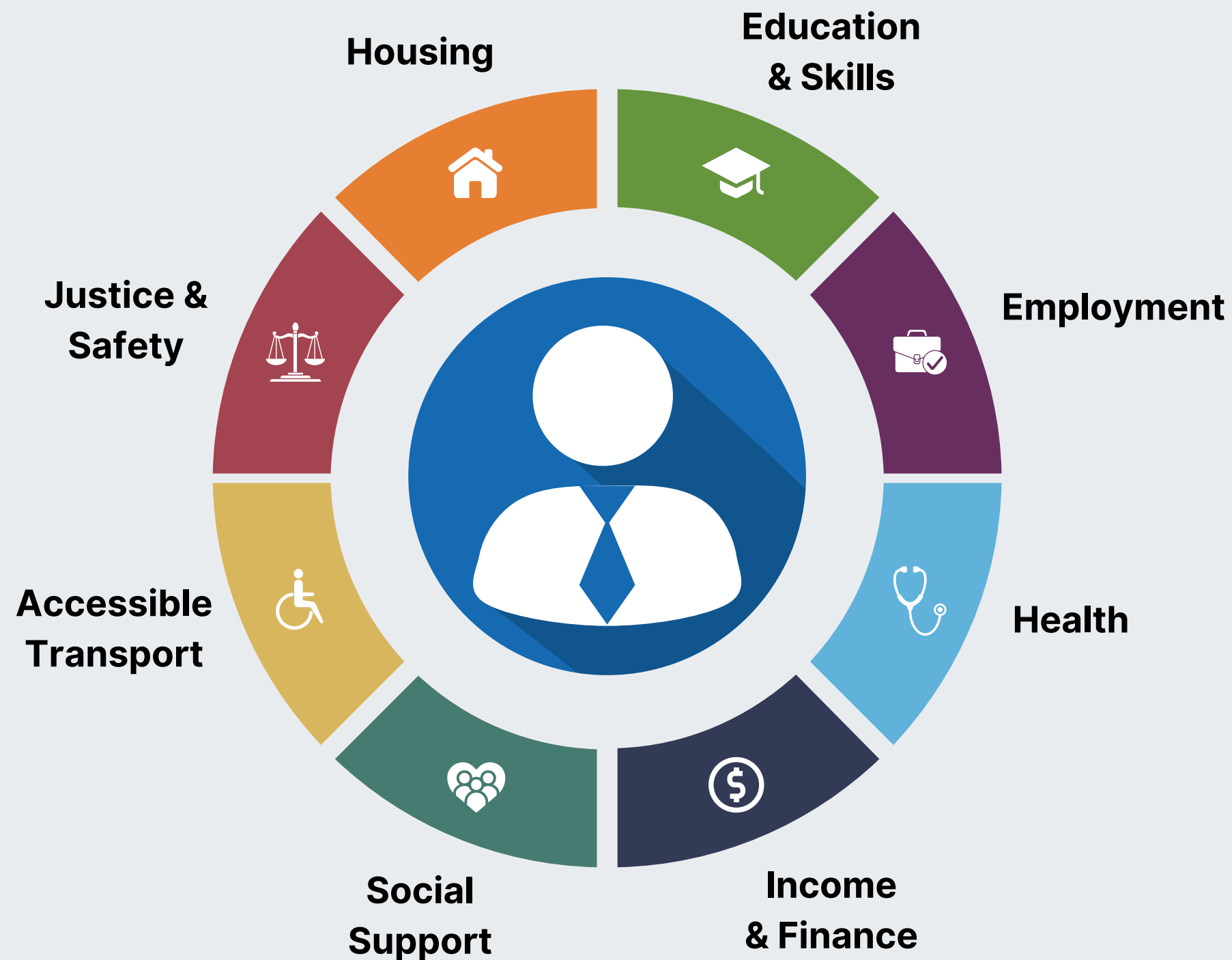
Person-centred reporting framework (AIHW)