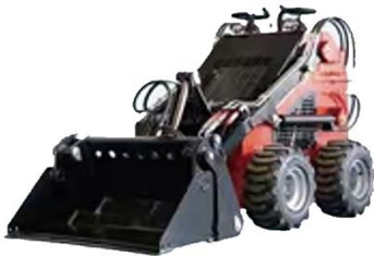
4 in 1 Bucket