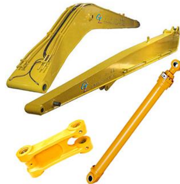
More Other Parts